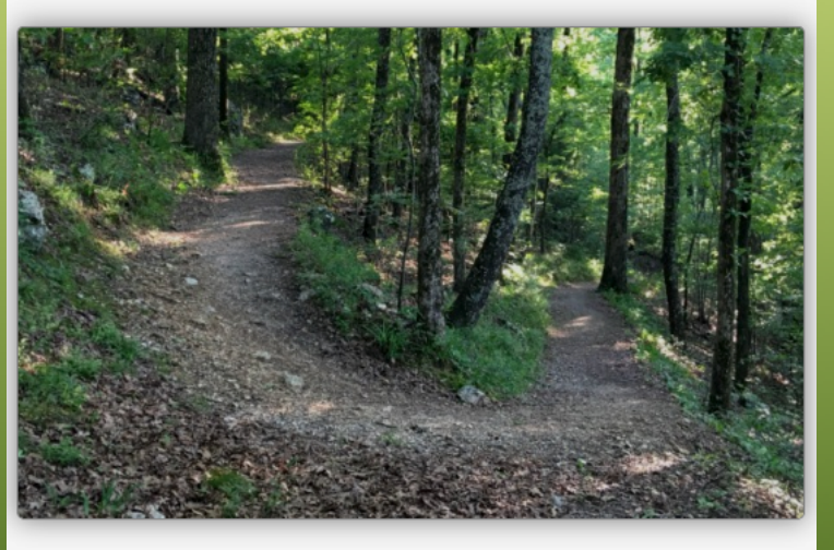
17-Mile Trail Run in Hot Springs National Park October 28, 2023