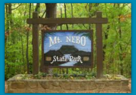
Mt Nebo Trail Run