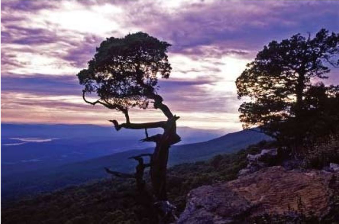
View from atop Mt Magazine