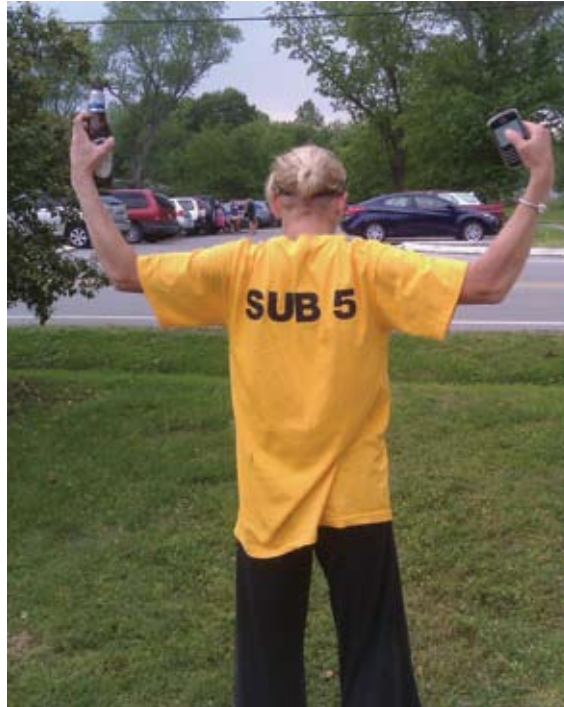
Strolling Jim 40 - Wartrace, TN