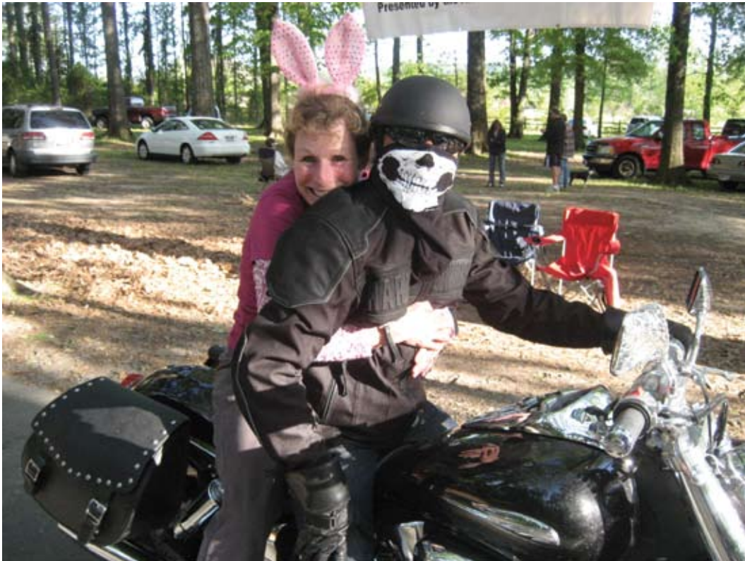
Ouachita Trail Race Director "Gone Bad"